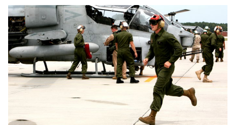
MCAS Cherry Point provides training on the SuperCobra attack helicopter (bottom) and bombing runs on nearby Piney Island (top).